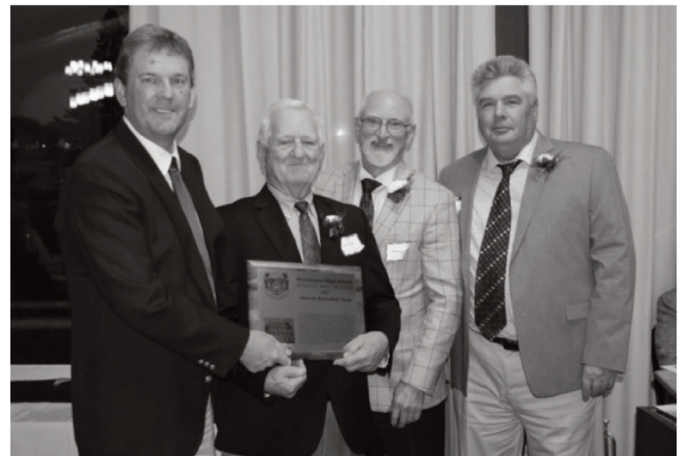
1967 Basketball Team