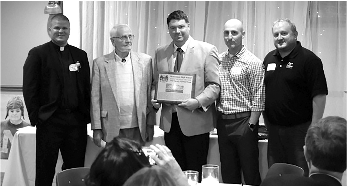
1998 Football Team